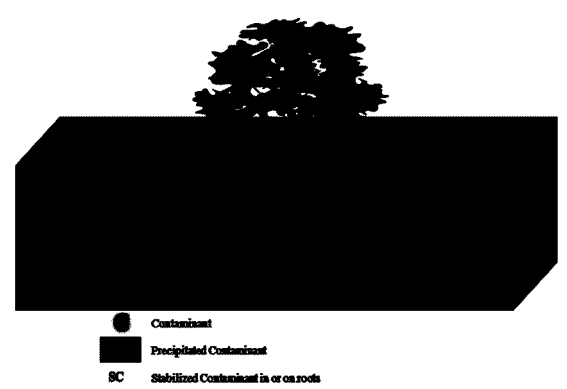
Fig. 2 Rhizofiltration of contaminated Groundwater (C-Contaminant; PC-Precipitated Contaminant, SC-Stabilized Contaminant in or on roots)

Contaminants that can be subject for rhizofiltration are: Lead, Cadmium, Copper, Nickel, Zinc, Chrom, Uranium, Cesium and Strontium.