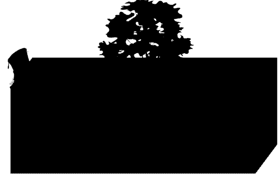
Fig. 1. Phytoextraction of contaminants from Groundwater and soil

Plants have the ability to extract water from soil and also necessary nutrients for growth. This ability to extract substances can be used for removal of contaminants from soil and groundwater.