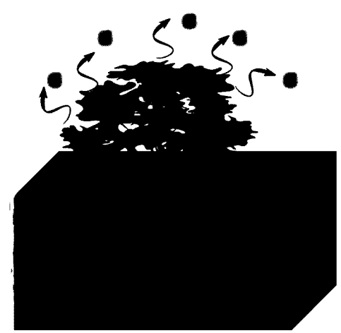
Fig. 4 Phytovolatilization (C-Contaminant)