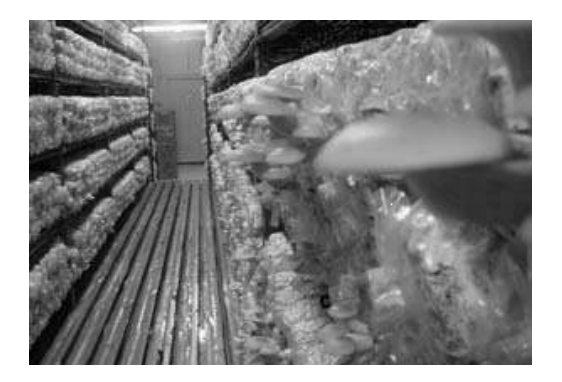
Figure 1. Scale up growth of Pleurotus ostreatus [3]

Small scale cultivation of Pleurotus ostreatus is common in the farms of South- East Asia [2]. In Europe and United States, the process was scaled up, allowing the harvesting of tons of mushrooms on tons of straw in relatively small sheds as seen in Figure 1: