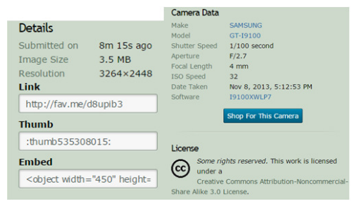
Fig. 3. Deviant Art

The platform has free account version, but after creating the account, the site offers the opportunity to buy "premium membership". It has a storage space of 10GB compared to 2GB the classic one. The update to premium can be monthly or on a one-year period, the price being $ 2.49 a month, and for a whole year to 29.95 dollars. It is a platform that gives artists and art