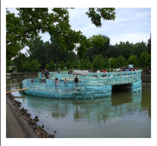
Figure 1. Bridge over the Bega River made of plastic bottles.

Environmental organizations in Romania annually collect hundreds of tons of plastic from the surface of the water and from shores. See Figure 1, Bridge over the Bega River made of plastic bottles.