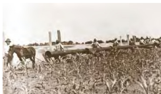
Figure 2. Works for the execution of the water network, 1914

To compensate for the maximum daily consumption, two water castles were built at the ends of the network. The castles were permanently supervised by employees.