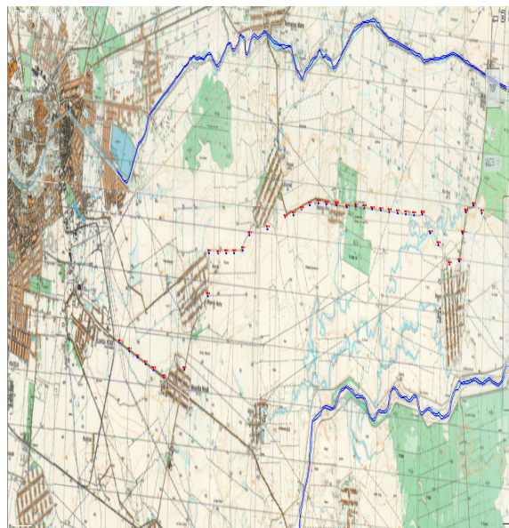
Figure 3. The location of the East Timișoara capture front

3.2.2 The capture front Timișoara Est (new front), which captures water from depths between 110 - 160 m, through 40 boreholes, with a projected flow of 600 l / s. The 40 boreholes are equipped with submersible pumps