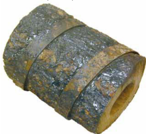
Figure 1. Wooden pipe with iron circles

The water distribution network suffers from the moral wear of component parts.