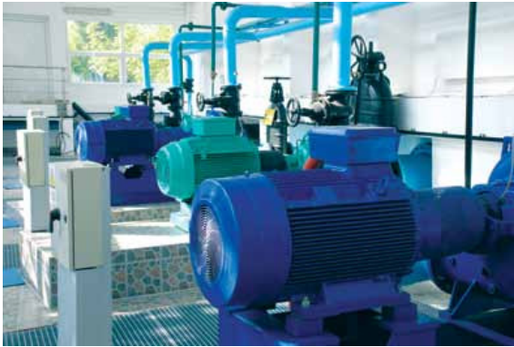
Figure 6. Distribution pumps