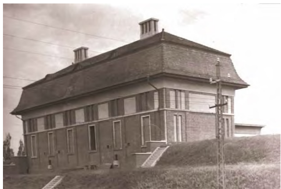
Figure 5. Deferuginator's building - Water plant no. 1

Currently the old Plant 1 is no longer in operation, part of it being transformed into a museum.