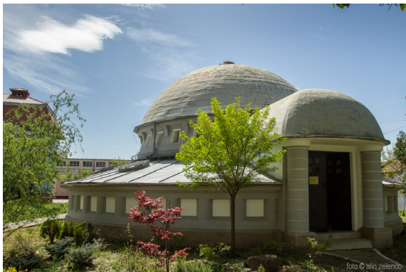
Figure 4. Fontains Group