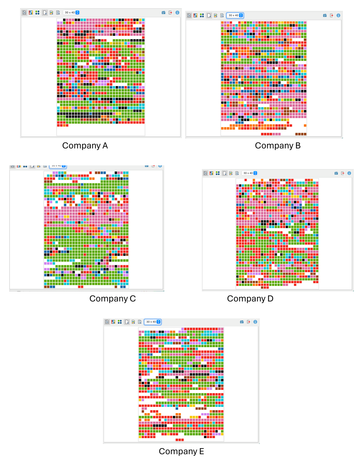
Graph Set 2. The Portrait of the Documents Based on Coded and Uncoded Segments in Order of Occurrence.