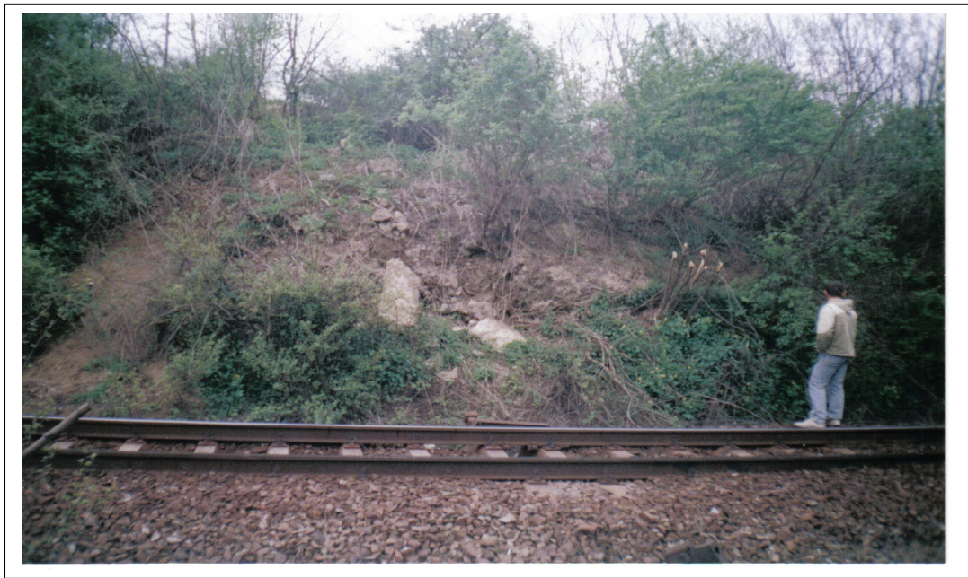
Fig. 4 The land slip near the rail road.