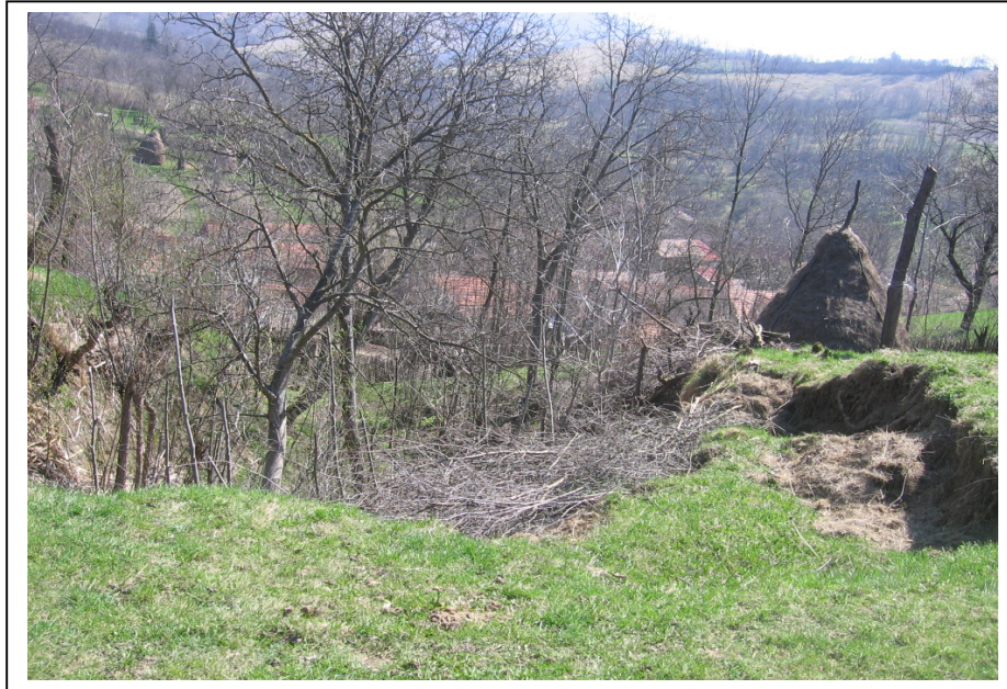
Fig. 2 The Cernilova land slip