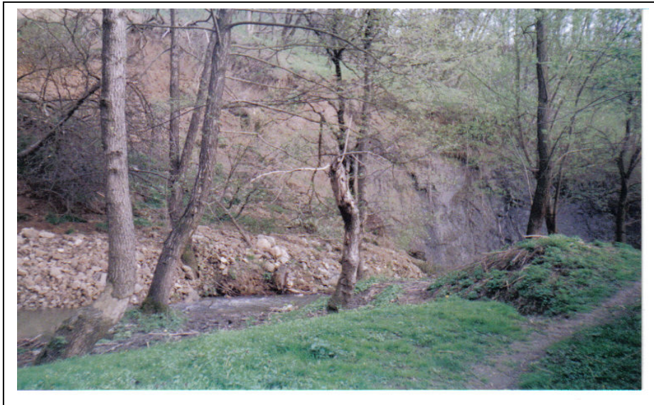
Fig. 3 The Cucuiului Hill land slip