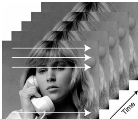
Fig. 1. Line scan of a video stream

Motion is indeed a very specific feature of the video and new video-driven perceptual measures need to be designed in order to be exploited in digital watermarking [3]. This simple example shows that the temporal dimension is a crucial point in video and that it should be taken into account to design efficient algorithms.