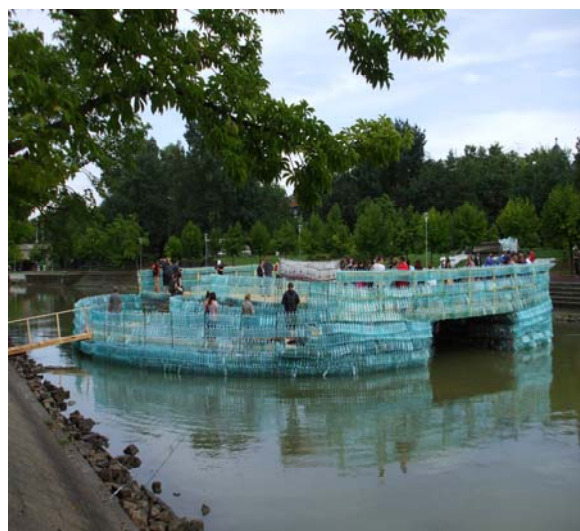
Figure 1. Bridge over the Bega River made of plastic bottles.

Environmental organizations in Romania annually collect hundreds of tons of plastic from the surface of the water and from shores. See Figure 1, Bridge over the Bega River made of plastic bottles.