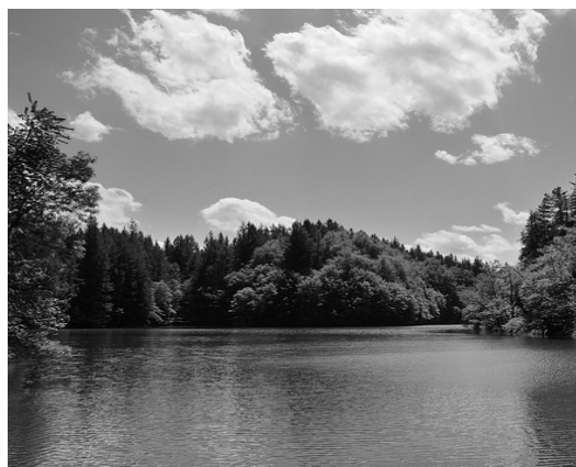
Figure 2. Buhui water source

From the Buhui water source, some of Anina's neighbourhoods feed water; this source is actually the most important source of water (Figure 2).