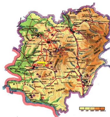
Figure 1. Location of Anina city

The town of Anina is located in Banat Montan, in the central part of Caraș-Severin County, 36 km away from Resita (Figure 1,[1]).