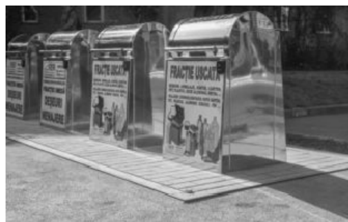
Figure 1. Organic islands for waste disposal in Brasov

Waste management through underground infrastructure is, of course, an important development that allows efficient and cost-effective approach to some of the most important needs of modern society. This paper aims to present the solutions provided by such an infrastructure, to identify the operational characteristics and the benefits of this collection method, as well as to provide information on the costs of these works compared to the costs of traditional waste collection systems. The lifetime of these waste collectors is important compared to the traditional life of the waste collectors. They have a much shorter operating time. Those presented in the paper will highlight future issues in order to analyse, present and increase the efficiency of the underground system for waste collection and recycling.