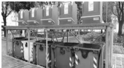
Figure 2. Waste disposal platforms in Brasov