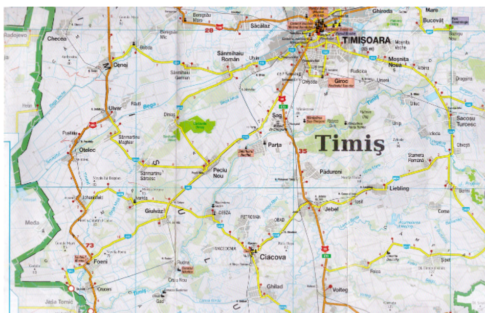
Figure 1. Map of the territory Bega – Timiș

The tectonic faults present in the crystalline fundament (at about 2000 m depth) determine a continuous subsidence of the area with 0.5 mm / year in Timișoara town, and 1 – 1.5 mm / year at Sânnicolau Mare town (figure 1)