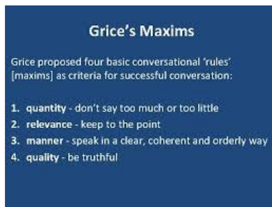
Figure 2. Grice's Maxims.

Here is a brief description of Grice's Maxims: