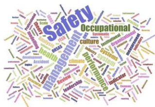
Fig. 2. The word cloud of keywords.