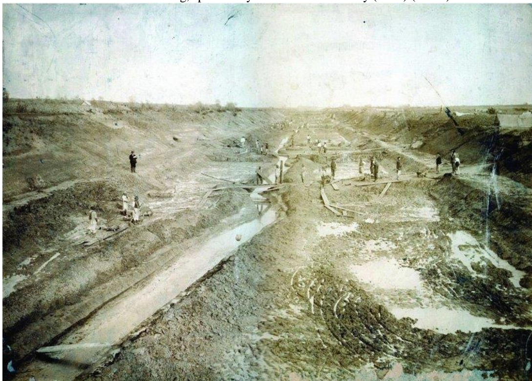
Foto 1. Bega Channel planning at the beginning of the 20 th century

The Bega Channel planning continued until the beginning of the 20 th century, with a considerable development through the provision of a lock system (1900-1916), their modernization, the reconstruction of the dikes, the consolidation of the banks and the commissioning of Timisoara's first hydropower plant from our country (1910) (foto 1).